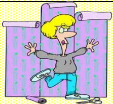
Hang some wallpaper