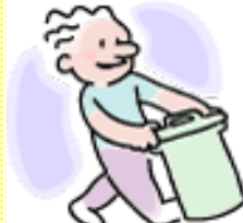
Take the dustbin out