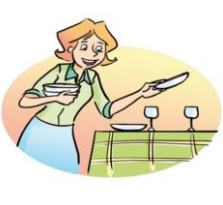
Set/lay the table