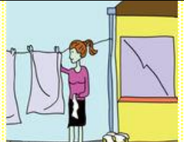
Hang out the clothes