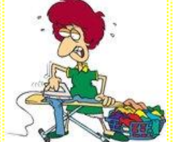
Iron the clothes