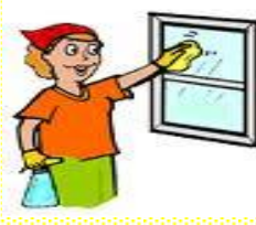
Clean the windows