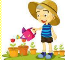
Water the plants/flowers