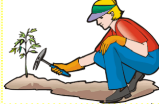
Garden / Do the gardening