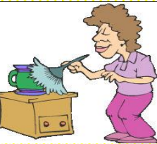
Dust the furniture