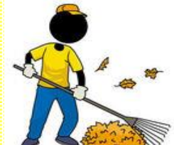
Rake the leaves