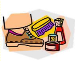
Polish the shoes