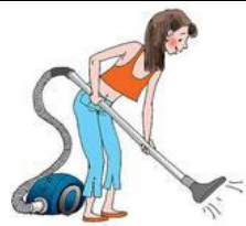
Hoover / vacuum