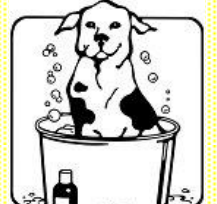
Wash the dog