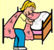
Make the bed