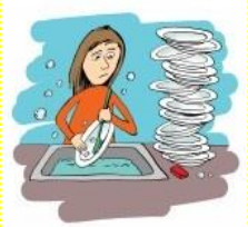
Do the washing up