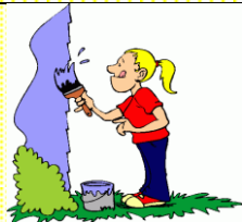
Paint the wall