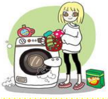
Do the washing