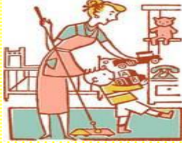
Tidy the house