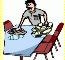
Clear the table