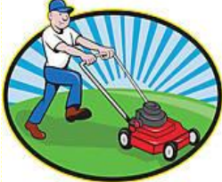
Mow the lawn