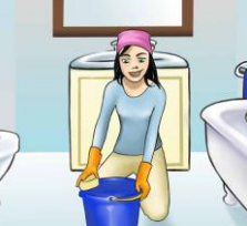
Clean the bathroom