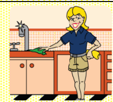
Clean the kitchen