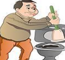
Clean the toilet