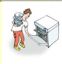
Load / empty the dishwasher