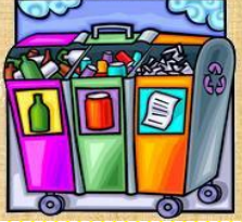
Sort out the rubbish