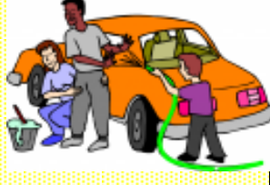
Wash the car