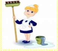
Mop the floor