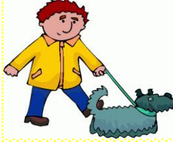
Walk the dog