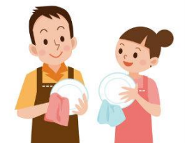
Dry the dishes