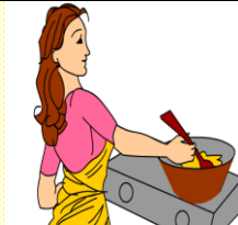
Cook / Do the cooking