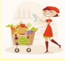
Do the shopping