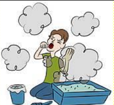
Change the cat's litter